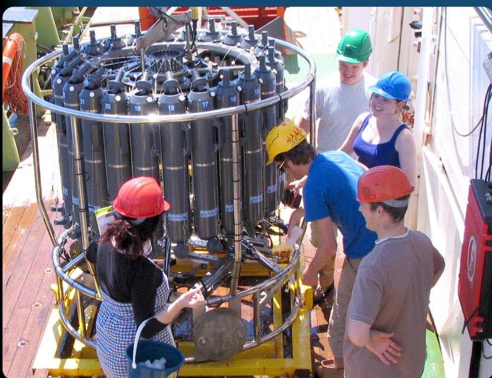
Oceanographers collect water from deep in the ocean to measure the growth of plankton and the amount of \text{CO}_2 they use